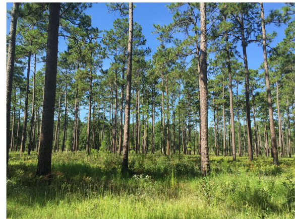
Fig. 2 Restored longleaf pine forest occupied by red-cockaded woodpeckers in northern Florida, United States, 2015.

fires every 1 to 5 yr. Historically, these fires were produced by spring and summer lightning strikes (Landers and Boyer 1999). Longleaf pine ecosystems, one of the most species-rich ecosystems in North America, once dominated the southeastern Coastal Plain, covering an estimated 94 million ha. Today these ecosystems occupy <5% of their original extent (Brockway et al. 2005; Jose et al. 2007).