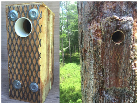
Fig. 1 Artificial insert boxes used in red-cockaded woodpecker population recovery in the Southeastern Coastal Plain in 2015. These boxes allow red-cockaded woodpeckers to nest in trees that are typically too young for natural cavities. Pictured here are boxes prior to (left) and after (right) installation.

Listed in 1973, the red-cockaded woodpecker ( Leuconotopicus borealis Vieillot, hereafter RCW) was among the first species listed under the ESA. Population recovery efforts for the species include intensive, species-specific management actions like installing artificial nest cavities (Fig. 1). More broadly focused conservation efforts are directed at restoring fire-dependent longleaf pine ( Pinus palustris Mill.) ecosystems and the embedded RCW habitat (USFWS 2003). RCWs exclusively excavate and nest in live pine trees and, while they breed within a variety of pine ecosystem types across the southeastern US, RCWs show a preference for longleaf pine ecosystems with an open understory (Jackson 1994). Longleaf pine is a shade-intolerant species. Fire suppression leads to expansion of hardwood plant species, such as oaks ( Quercus L. spp.), that shade out longleaf pine seedlings and create an understory used by RCW nest predators. Maintaining an open condition (Fig. 2) in these systems requires surface