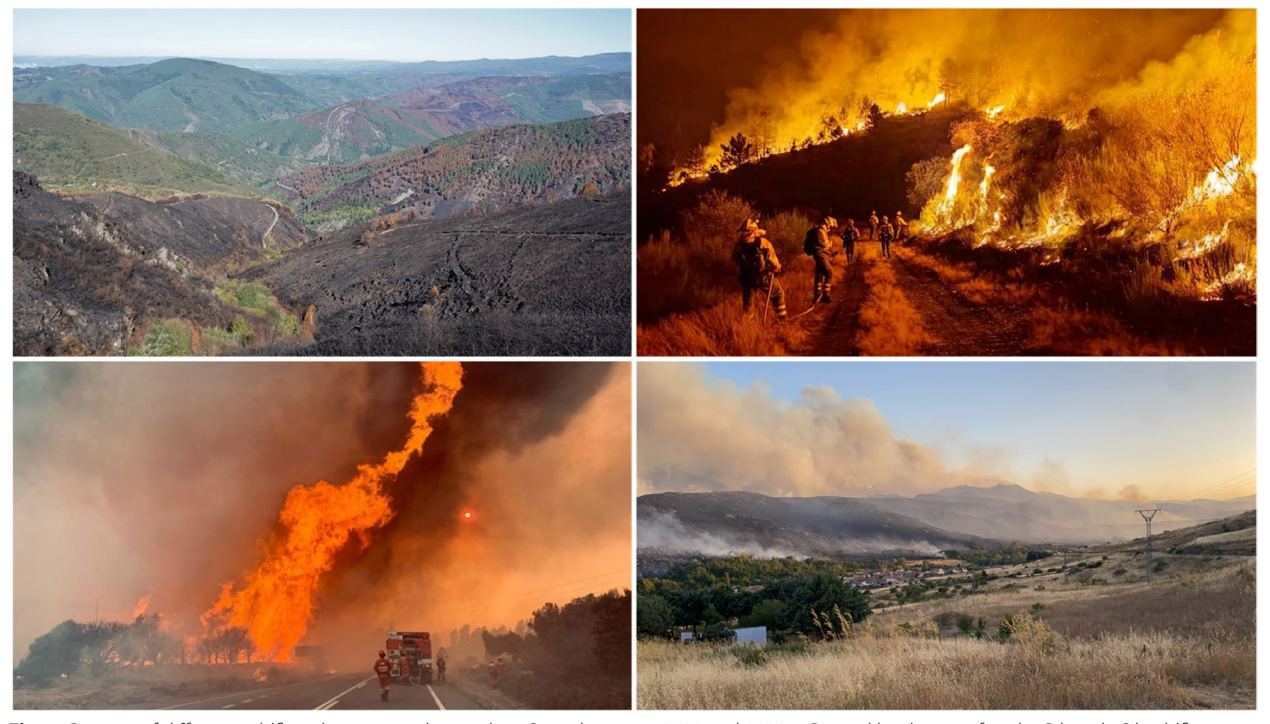
Fig. 1 Pictures of different wildfires that occurred recently in Spain between 2020 and 2022. a Burned landscape after the Ribas de Sil wildfire (Lugo province). b Firefighters at the Carballeda de Valdeorras wildfire (Ourense province). c Extinguishing services acting in the Sierra de la Culebra wildfire (Zamora Province). d Burning hills during the Navalacruz wildfire (Ávila province)

There is currently growing concern about the climate crisis and greater recognition of the value of natural capital, the domination of forest cover by monoculture plantations, and the high annual incidence of wildfires. There is also increasing social concern about the consequences