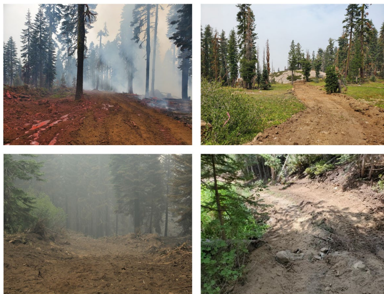
Fig. 3 As fire exclusion induces ecosystem conditions to change, wilderness managers may feel increasing pressure to use mechanized equipment and other high impact suppression activities within wilderness to mitigate uncharacteristically severe wildfires. In these photos, the impact of a bulldozer, used to create fireline during the 2021 Dixie Fire, can be seen in the Bucks Lake Wilderness in California (Courter 2021). Treating wilderness landscapes with prescribed fire may lessen the need for suppression tactics like this in the future

changes in structure and composition nor have they experienced the uncharacteristically severe wildfires which are affecting their fire-excluded counterparts (Hagmann et al. 2021; Parks et al. 2023). As fire regimes are restored through human-ignited fire, the probability of uncharacteristically severe fires and conversion to non-forest decreases (Walker et al. 2018), with intentional burning additionally able to buffer climate impacts on wildfire activity (Roos et al. 2022) and on subsequent vegetation response (Davis et al. 2023). Additionally, the reduction of fuel and increases in fuel heterogeneity through intentional burning increase the capacity and ability of wilderness managers to manage lightning-ignited fires (Fig. 3). This rationale has been cited in prescribed fire plans for the Mission Mountains Wilderness (Mission Upland Burning Project 2011) and the Boundary Waters Canoe Area Wilderness (Hi Lo Project 2018).