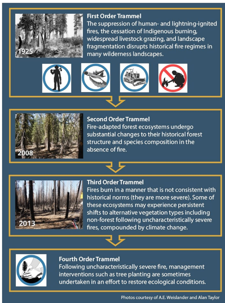
Fig. 1 Graphic shows the four orders of trammeling —cascading actions that foreseeably result from fire exclusion over time

Finally, the fourth order trammel occurs when previously unnecessary management interventions are undertaken in wilderness in an effort to salvage or restore ecological elements in the wake of uncharacteristically severe fires. Even as these actions seek to improve conditions, they are considered degradations of the untrammelled quality (Landres et al. 2015). An example can be seen in the Bandelier Wilderness, where 800 seedling trees were planted in 2020 within the footprint of the 2011 Las Conchas Fire. These actions were taken to counteract the limiting effects on natural regeneration resulting