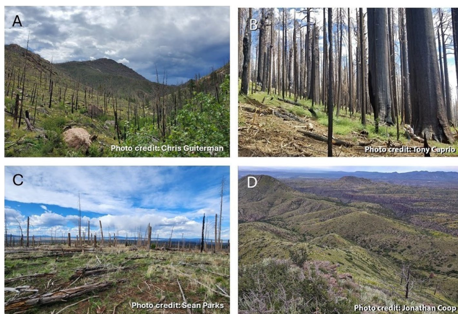
Fig. 2 Photos show historically forested landscapes following uncharacteristically severe fires. A A heavily impacted dry mixed-conifer forest in the Cache La Poudre Wilderness in Colorado following the 2012 High Park Fire. B Fire-killed giant sequoias in Sequoia and Kings Canyon National Park in California following the 2021 KNP Complex. C Massive mortality in a Douglas-fir forest in the Gila Wilderness in New Mexico following the 2006 Bear Fire and the 2012 Whitewater-Baldy Complex. D Repeated high-severity fires have changed a forested site into a shrub field in the Dome Wilderness in New Mexico

killed between 7,500 and 10,600 sequoias with trunk diameters of four feet or greater, or 10–14% of the large sequoias across the Sierra Nevada range (Stephenson & Brigham 2021). A survey of giant sequoia groves that burned between 2015 and 2017 revealed that approximately 84% of legacy giant sequoias were killed by high-severity fire (Shive et al. 2022).