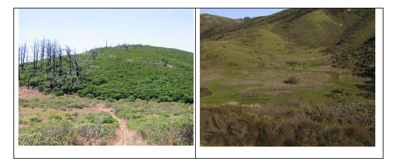
Figure 1 . Typical landscape in both sample areas. Point Reyes National Seashore on the left; Golden Gate National Recreation area on the right.