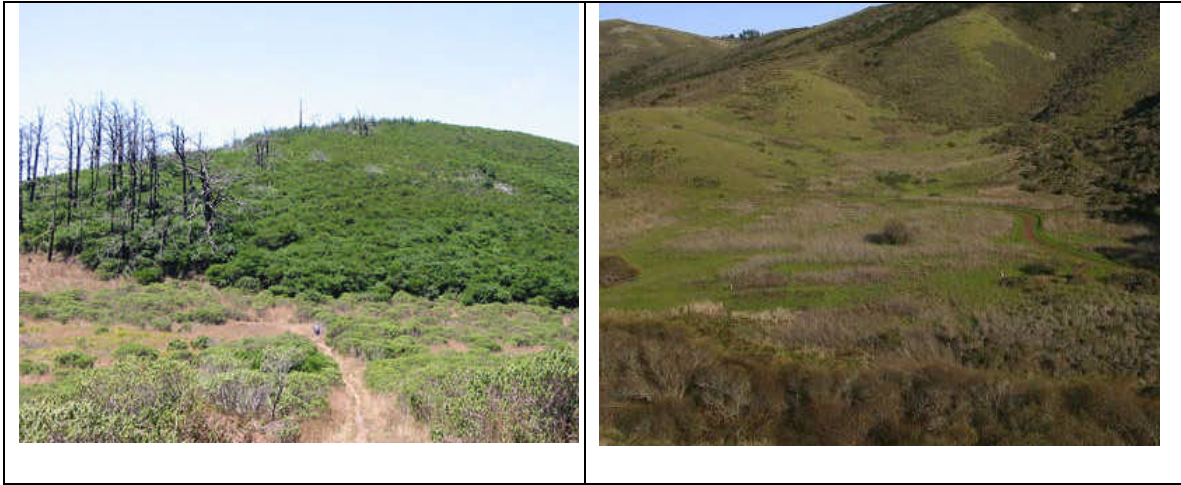
Figure 1. Typical landscape in both sample areas. Point Reyes National Seashore on the left; Golden Gate National Recreation area on the right.

Williams, K., R. J. Hobbs, and S. P. Hamburg. 1987. Invasion of an annual grassland in Northern California by Baccharis pilularis . Oecologia 72:461-465.