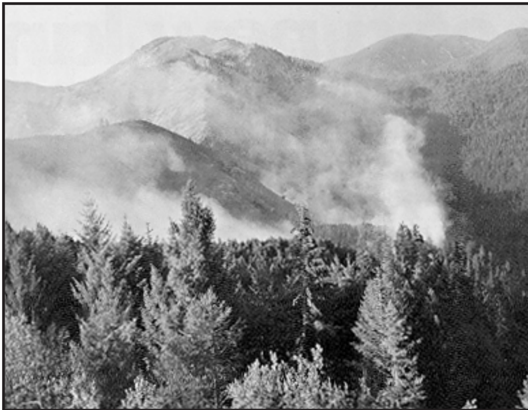
Figure 2. The Fritz Creek fire in 1973 was the first large fire to occur in the White Cap Fire Management Area of the Selway-Bitterroot Wilderness on the Bitterroot National Forest.

The Gila Wilderness in New Mexico was the next Forest Service area to initiate a wildland fire use program. The first fire in the Gila managed under the new program occurred in 1975, and in 1978, the Langstroth fire burned 1,295 ha (3,200 ac). The Gila and Selway-Bitterroot programs would grow to become the premier Forest Service wildland fire use programs. Information gained from these experiments was instrumental in changing Forest Service fire policy from fire control to fire management (DeBruin 1974). In 1978, the Forest Service abandoned the 10:00 AM policy in favor of a new policy that encouraged the use of wildland fire by prescription.