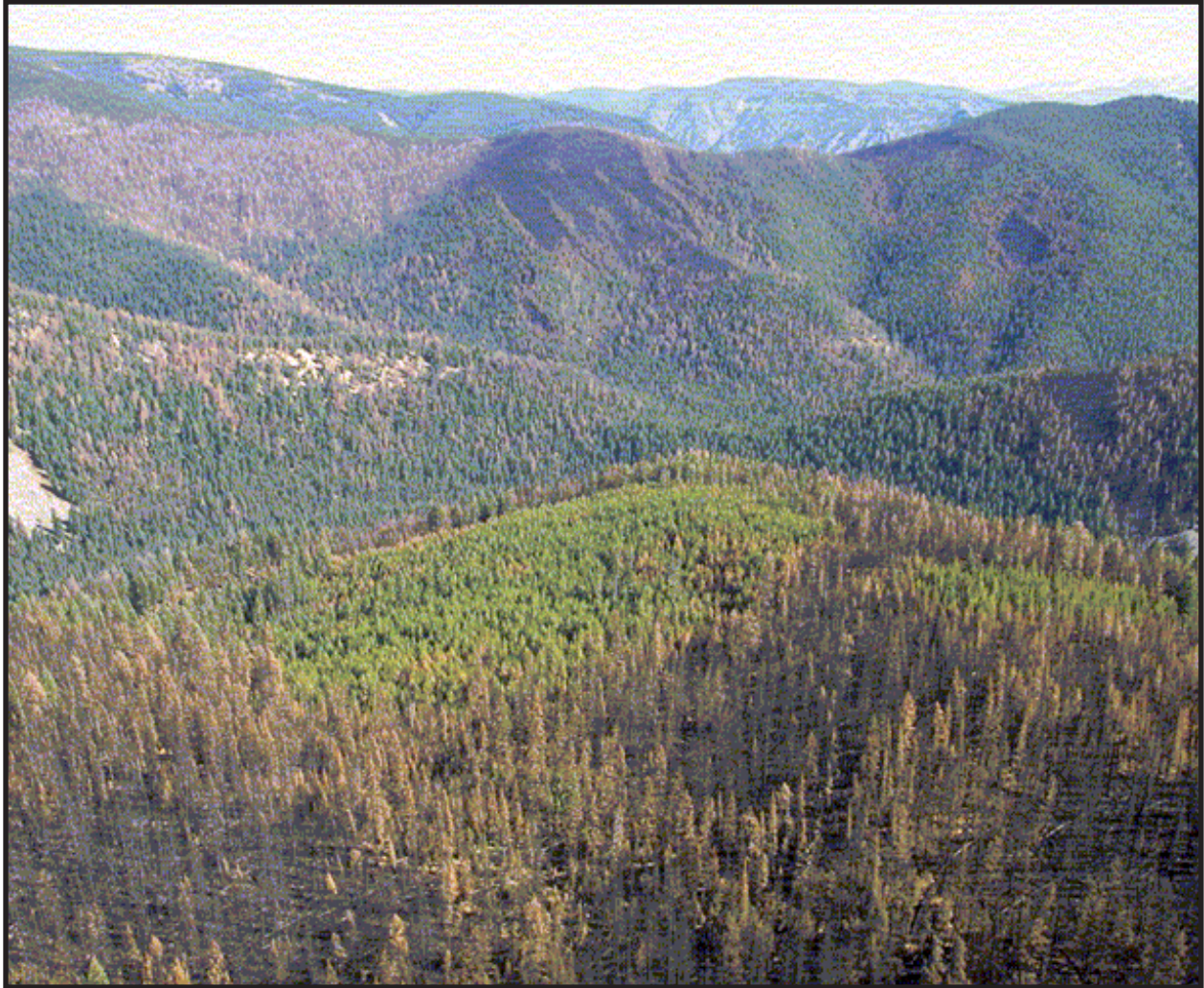
Figure 4. In 2000, the Lost Packer Meadow fire burned around fires that burned in 1990 and 1996, forming a pattern of burned and unburned areas.

burn under prescribed conditions since 2001, mostly in Alaska (Table 1). The area burned each year has varied with large areas burning when conditions are favorable in the refuges in Alaska. During intervening years, a small number of fires burned a reduced amount of area.