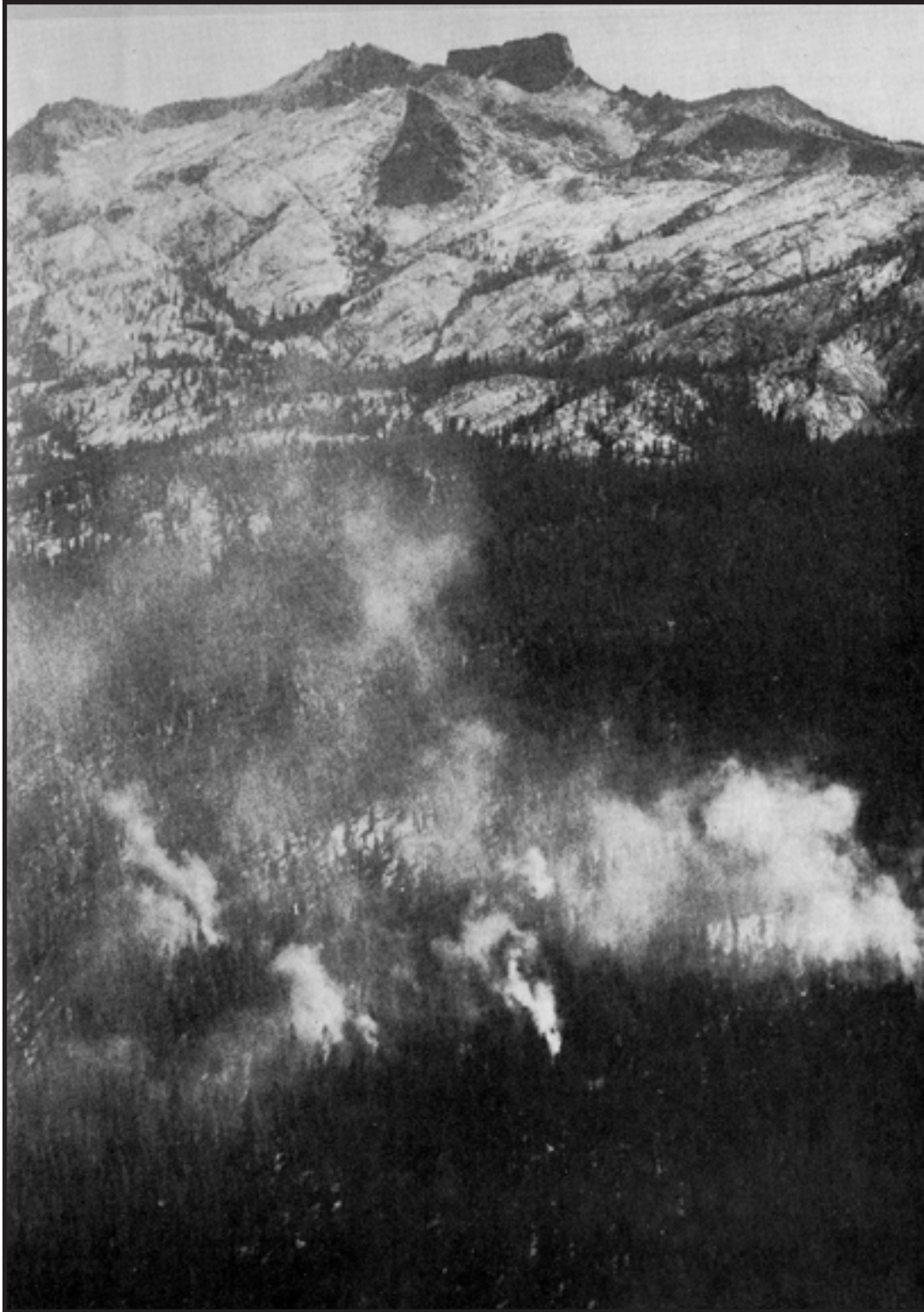
Figure 1. The Ball Dome fire in Sequoia and Kings Canyon National Parks is typical of many fires that have burned as part of the wildland fire use program in the Sierra Nevada national parks. It burned to 47 ha (115 ac) in 1972.