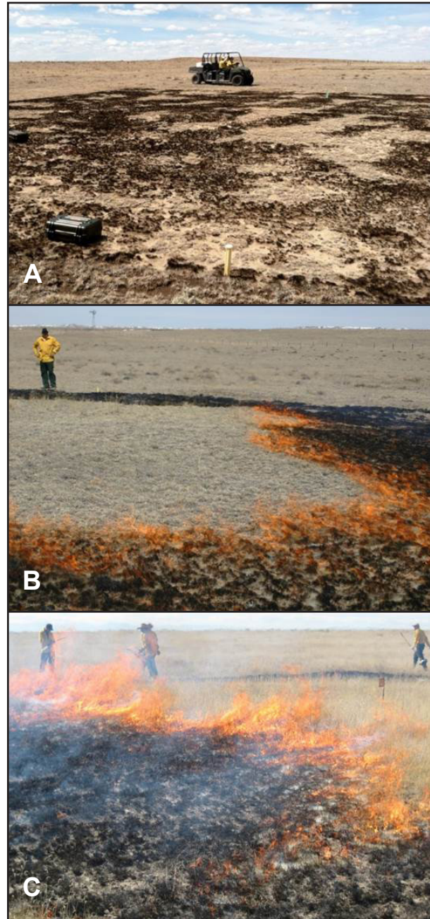
Figure 2. Examples of flame lengths and patchiness in burned areas associated with prescribed burns conducted with fuel loads of: (A) <350 kg ha -1 , (B) 350 kg ha -1 to 600 kg ha -1 , and (C) 700 kg ha -1 to 1000 kg ha -1 in the shortgrass steppe of northeastern Colorado.

burns conducted with fuel loads less than 350 kg ha -1 , the fires failed to carry across portions of the target area, resulting in only 42% to 58% of the thermocouples being burnt (Figure 2A). These percentages based on the thermocouples were similar to our visual estimates of