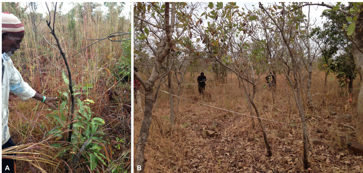
Fig. 3 Seasonal fire intensity experimental plot in Tabou Village, Mali, Africa, in 2016. (A) A perennial grassland in Tabou Village, Mali, that was still too moist to carry a fire in early January, and (B) heavy leaf litter in a well trampled savanna.

We found that the characteristics of experimental fires varied by season. As expected, mean visual efficiency and mean combustion completeness increased as the dry season progressed. We also found that the highest intensity fire occurred in the EDS (in a dense field of dry annual grasses, with a head-fire). While early fires are often thought to be less intense (e.g., Govender et al. 2006; Smit et al. 2016), other studies have also found that EDS fires can be very intense if burned with a head wind (Cook et al. 2015). Our study found that EDS fires also exhibited the greatest variation, probably due to the type of grass burned. While the minimum intensity value increased from