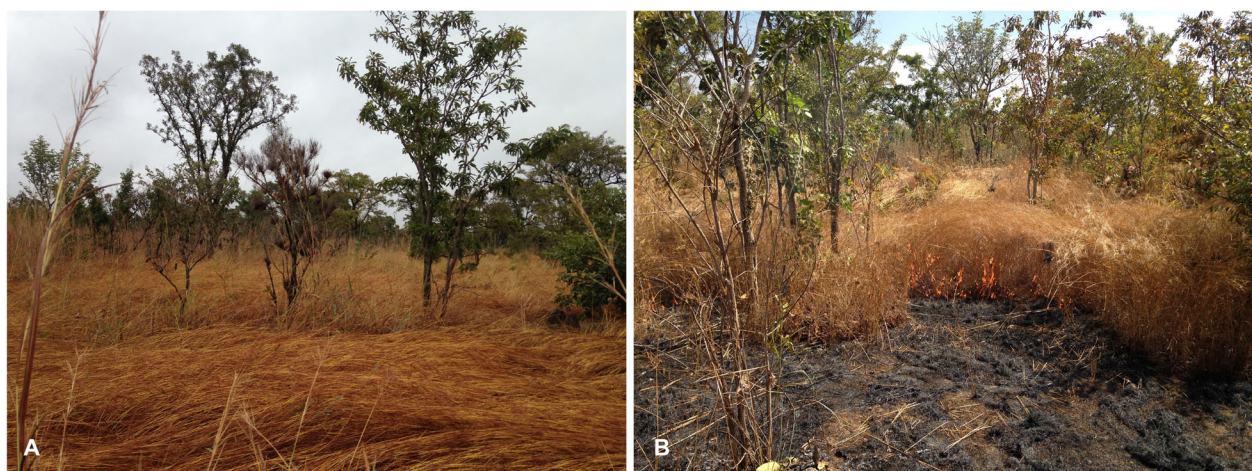
Fig. 4 Seasonal fire intensity experimental plot in Tabou Village, Mali, Africa, in 2016. (A) A field of annual grasses that had fallen over by the time of a (B) mid-season fire.

Byram's fire intensity values were similar to those from several other studies. Our fires had intensity values between 12 to 1400 \text{ kW m}^{-1} , which compares somewhat