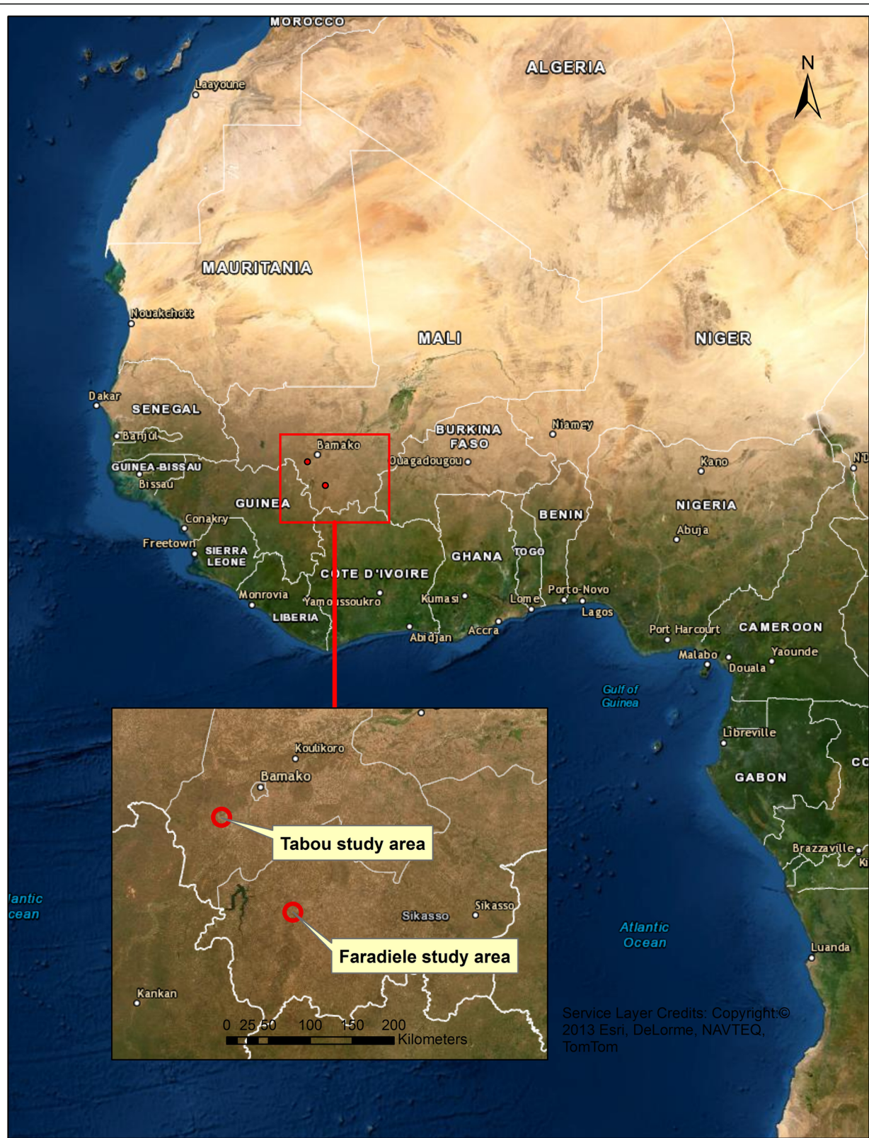
Fig. 1 Location of the research sites in southern Mali, Africa, used for our seasonal fire intensity study, from 2014 to 2016